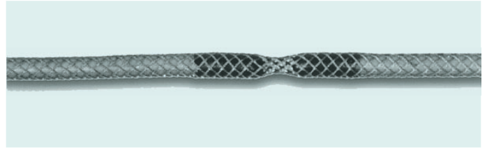
Joining stocking for pulling underground cables.