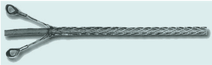
Double eye stocking for pulling underground cables.