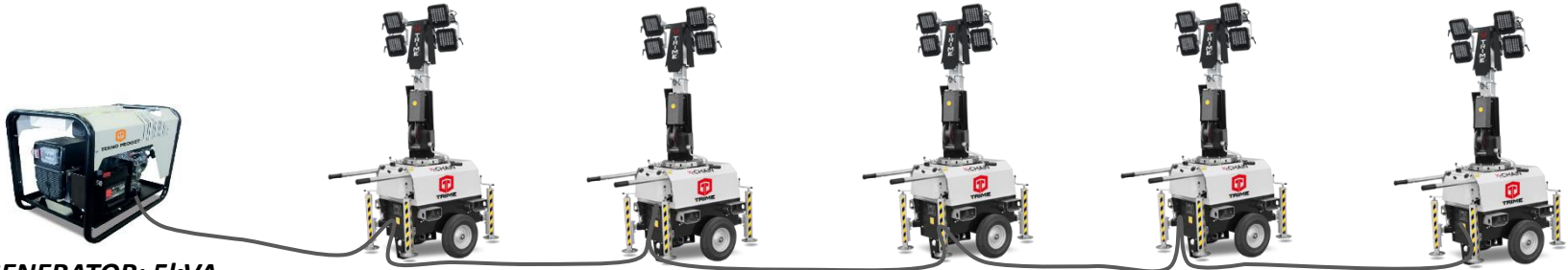
GENERATOR: 5kVA 1-ph 230V

Max connection in every single section: Cable 10 sqmm, up to 55m; Cable 6 sqmm, up to 45m;