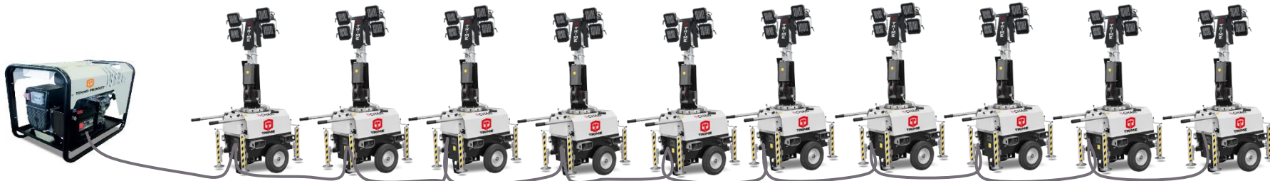
GENERATOR: 10kVA 1-ph 230V

MAX connection to 5kVA Gen: no. 5 units X-CHAIN 4x160W LED