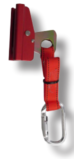
antifall device type DA1