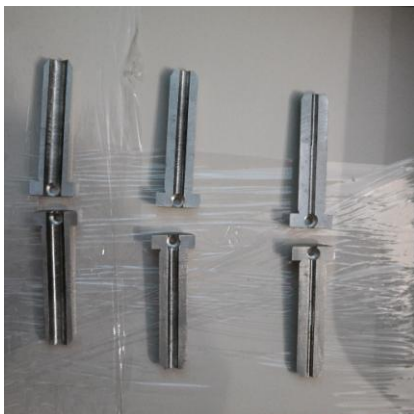
- Diameter range of fiber optic cables 2,5-6mm