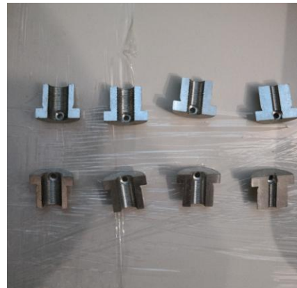
- Micro-tubes diameters 5-10mm